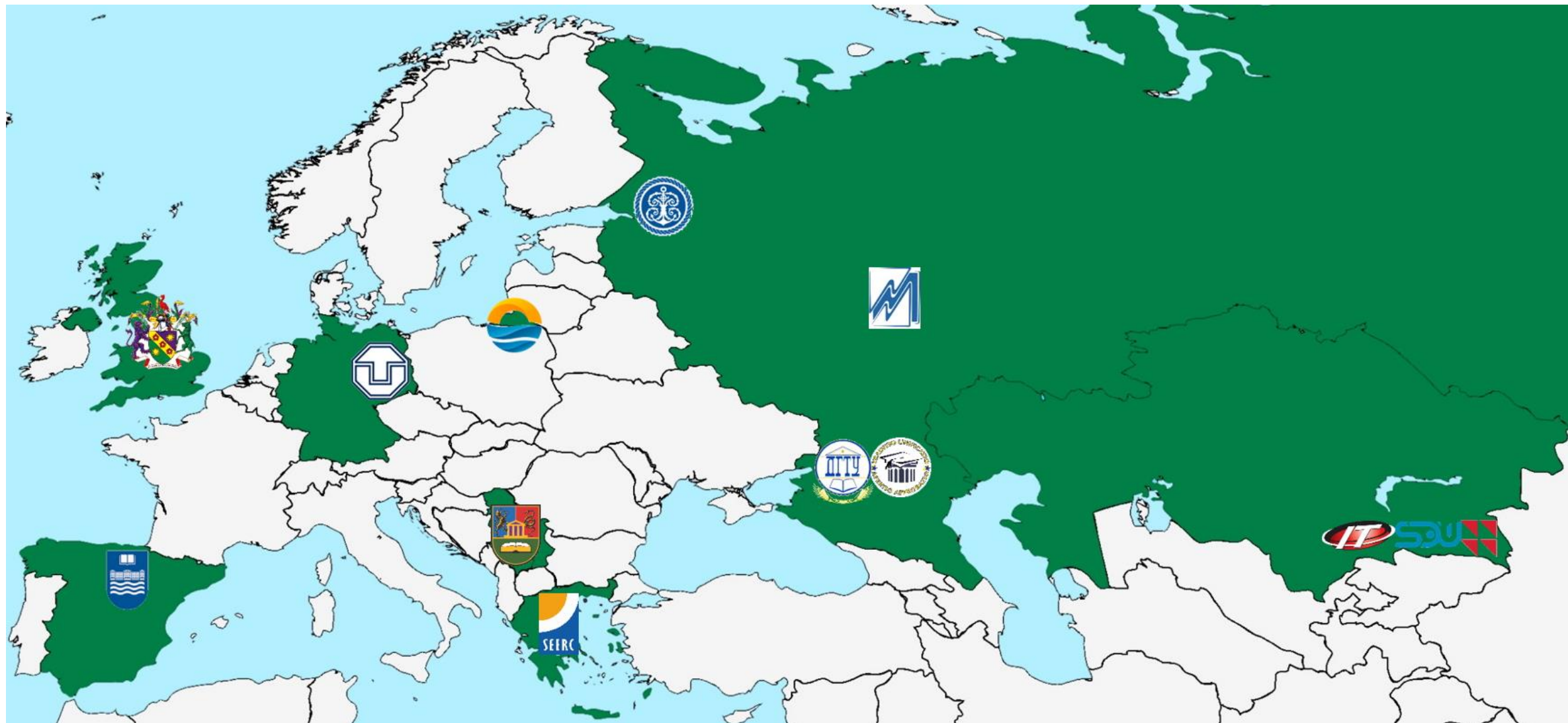
International online conference „Modelling e4e processes: innovative educational programmes and network partnership“, Rostov on Don, 9-11.9.2020